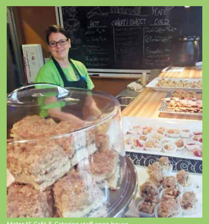
Metro 45 Café & Catering staff open house

The made-to-order food will be a delicious and fast way to grab your coffee and scone, or your lunch to go, during the work week. We're also working to be able to provide delivery. Need catering for your meetings or events for breakfast, lunch or dinner? Allow us to provide great food at competitive prices, and you'll be supporting LMM and the education and success of our students in the process.