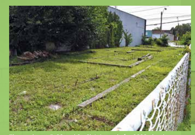
The garden at E. 23 and St. Clair is ready for 2020 planting.

Partnerships like these allow LMM to continue offering more opportunities to Men's Shelter residents to build a sense of community and value.