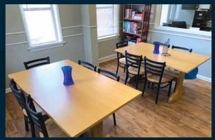
Donated dining sets in Westhaven Youth Shelter