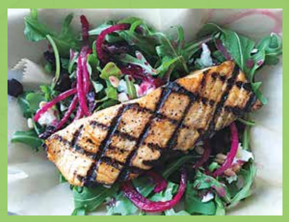
Grilled Salmon Salad with arugula, dried cranberries, goat cheese, pine nuts, pickled red onion

Stay tuned for more updates on an official opening date, café hours and the catering menu on LMM's social media channels (@LMMCleveland on Facebook, Twitter and Instagram) and make sure to spread the word! We look forward to serving you great food with an even better story.