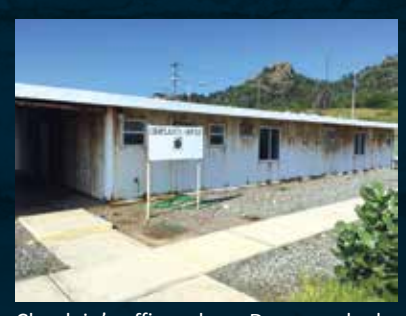
Chaplain's office where Drew worked