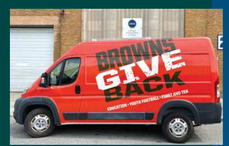
Cleveland Browns drop off van full of clothing donations.

LMM is grateful for the Cleveland Browns and their ongoing support, especially throughout COVID-19.