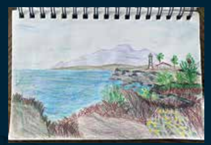
One of Drew's sketches