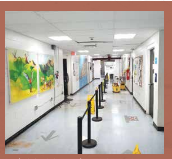
Men's Shelter hallways reflect need to social distance.

In order to follow social distancing guidelines put in place by the state of Ohio and to ensure those in our community who seek shelter are accommodated with safe, adequate services, Lutheran Metropolitan Ministry's Men's Shelter at 2100 Lakeside has worked within Cuyahoga County's Continuum of Care to shelter individuals in multiple hotel locations throughout Greater Cleveland.