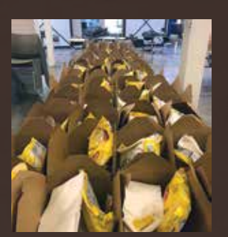
Boxed lunches are assembled for shelter residents.

Kitchen pump out up to 10,000 meals each week for people who are homeless at eight shelter sites. Thanks to LMM's great staff and partners, not one person who sought shelter with our agency has gone without food during the COVID-19 pandemic.