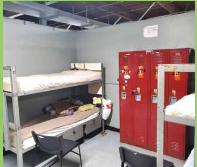
The Men's Shelter at 2100 Lakeside provides a safe place to rest.

LMM's Breaking New Ground affordable housing initiative is creating an innovative model for ending family homelessness in Cleveland by purchasing and renovating homes in the St. Clair Superior neighborhood. Families exiting homelessness will be