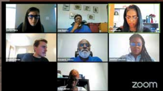
Election Forum, August 19

LMM's Office of Advocacy held a voter education forum in August on Facebook Live, and there's still time before the election to watch the replay!