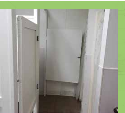
Girls Bathroom at Youth Shelter

re-sil-ience: the capacity to recover quickly from difficulties; toughness.