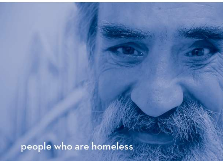
people who are homeless