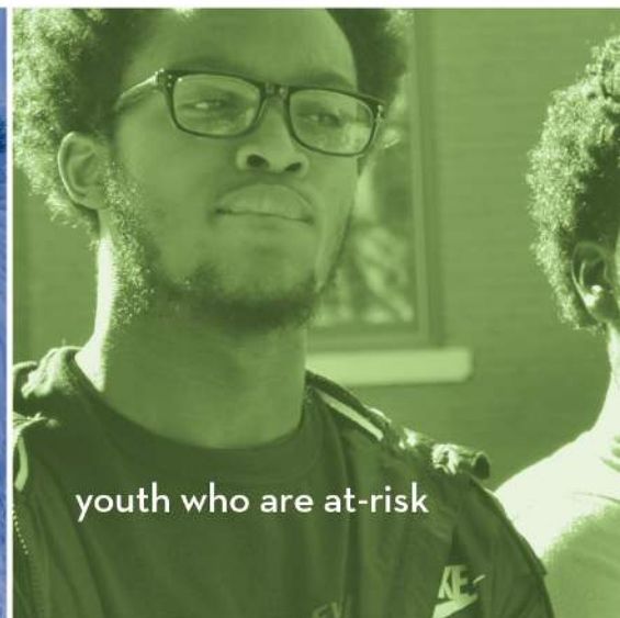
youth who are at-risk