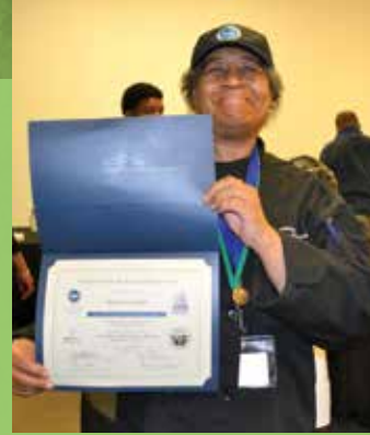
Proud graduate of Culinary Arts program shows off her accomplishment.