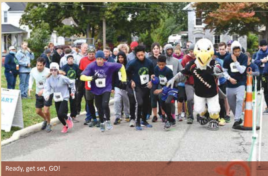
Ready, get set, GO!