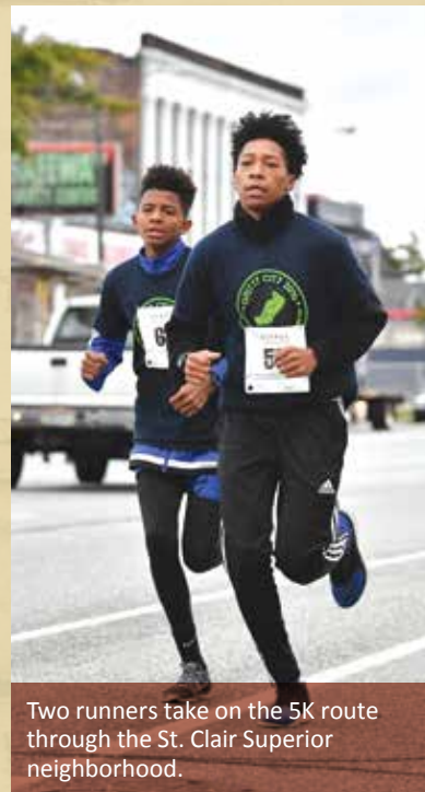
Two runners take on the 5K route through the St. Clair Superior neighborhood.