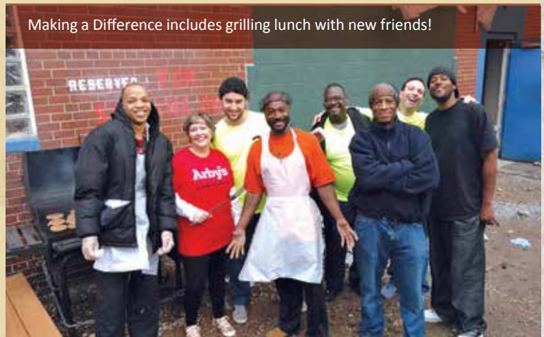
Making a Difference includes grilling lunch with new friends!