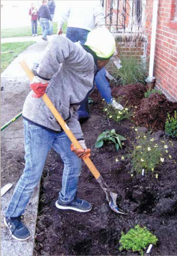
Boy Scout Troop 620 helps with landscaping.