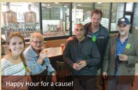
Happy Hour for a cause!