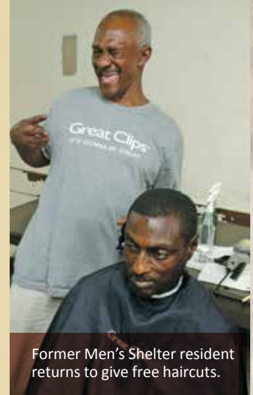
Former Men's Shelter resident returns to give free haircuts.