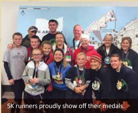
5K runners proudly show off their medals.