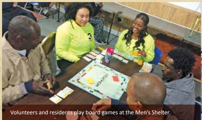
Volunteers and residents play board games at the Men's Shelter.