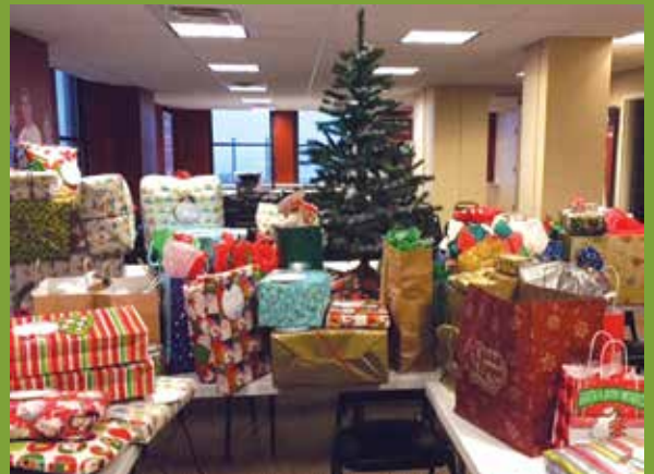
"Be a Santa to a Senior" gifts

Following the purchase and delivery of the senior's requested items by Home Instead, AGS guardians will take on the task of making sure each gift is wrapped with love and delivered to the hands of each senior they care for, just in time for the holidays.