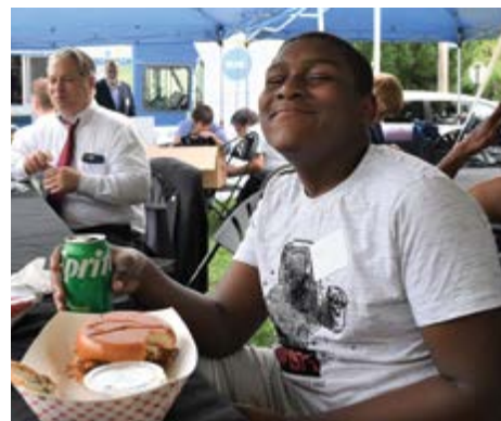
Community BNG celebration catered by Metro45.

In addition to the ribbon cutting, we invited the neighborhood for fellowship and a tasty bite to eat from our Metro45 Food Truck. It was wonderful meeting the neighbors and telling them about LMM. Two of the neighbors came by and told us their stories of having once been residents of our Men's Shelter, and how happy they are to welcome and help out the two families moving in.