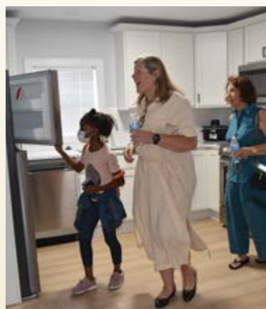
Walking through the newly renovated home.